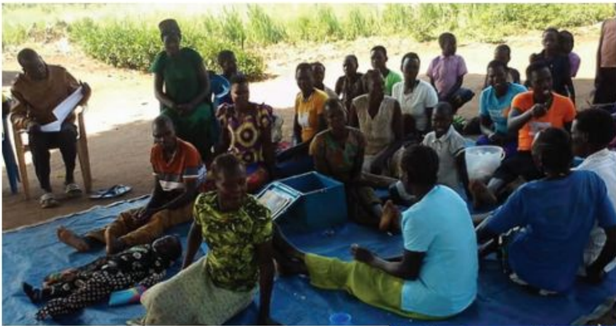
Training of men and Women in VSLA Methodology supported by COHAD Uganda:

In order to improve on food security, nutrition, and livelihoods of the refugees and host communities, COHAD provided cash assistance to female household heads, Income generation activities start up materials /cash to youth groups in refugee and host communities ,conducted technical training on management of selected IGAs, VSLA methodology , VSLA toolkits to refugee and host population and conducted Group Dynamics to Youth groups. COHAD trains and supports both Men and women in the formation and management of VSLA as shown in Picture 3 below. A total of 300 VSLA members were trained on basic skills of VSLA concepts and record keeping techniques, Eight (8) VSLA groups received assorted VSLA toolkits and a total of 8 youth groups comprising of 220 individual youths were trained on leadership skills and group development